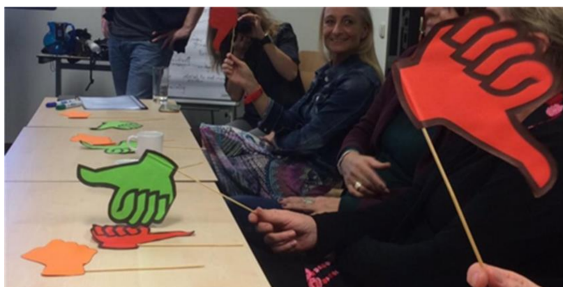
Figure 2. Overview of thumbs used for the focus group sessions.